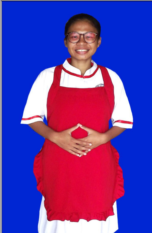
(Noted : She Is Using Glasses Min - 1,25)